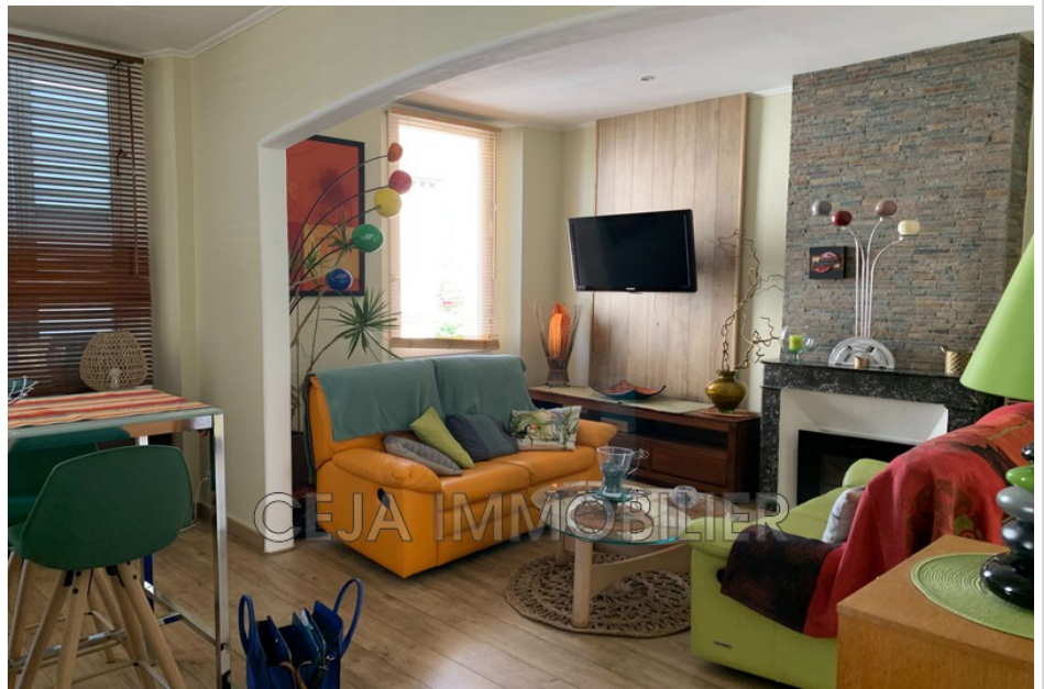
Apartment T/25 Draguignan

Free as of March 31, 2022 In downtown DRAGUIGNAN, furnished F2, including a living room with fitted and equipped kitchen, a bedroom, a shower room with WC.